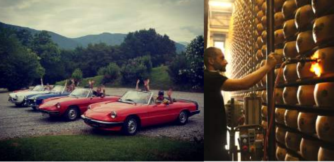
DAY 6- 23 SEPTEMBER 2019 DRIVE DAY THROUGH THE PLAINS OF THE PARMENSE, COOKING CLASS AND AGEING CELLARS OF PARMIGGIAN AND CULATELLO, SKETCHING OVER THE LAKES