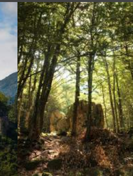
DAY 5- 22 SEPTEMBER 2019 PAINTING UNDER THE FOREST CANOPY- MUSHROOM AND TRUFFLE HUNT, DINNER WITH THE LOCALS AND MELINA