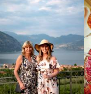
DAY 9- 26 SEPTEMBER 2019