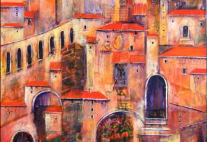
DAY 8- 25 SEPTEMBER 2019 LAKE ISEO WITH LOCAL ITALIAN ARTIST, WINERY LUNCH, FAREWLL DINNER