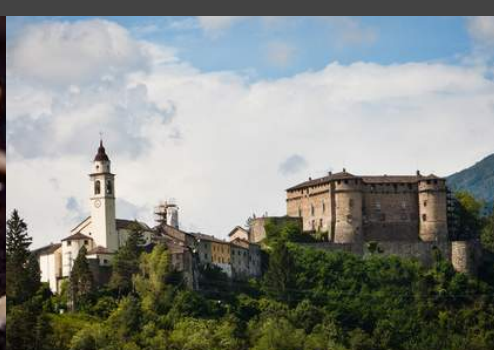
DAY 4-21 SEPTEMBER 2019 PORCINI FESTIVAL OF BORGO VAL DI TARO, CASTELLO DI COMPIANO, LUNCH A SPECIAL TROUT FARM, DINNER AT THE CASTLE