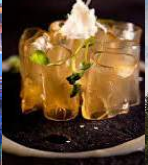
DAY 3- 20 SEPTEMBER 2019 BOLOGNA - ITALY'S "LEARNED" CITY MARKET AND FOOD TOUR, SKETCHING